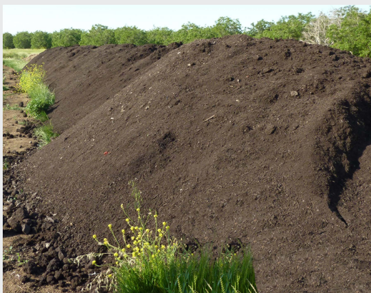
240 TONS BULK COMPOST/MANURE

Results in 0.5 - 1lb of soluble humus per ton for soil amending benefits