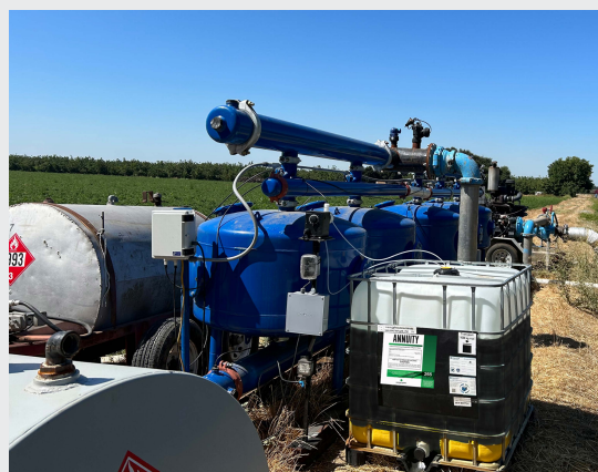
240 GALS LIQUID ANNUITY